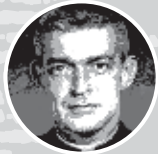
VINCENT CAPODANNO (PANEL 25E, LINE 35)